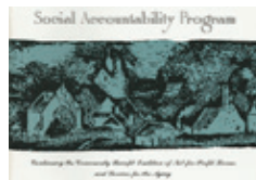
1989 CHA published the first guide for community benefit, then called the social accountability budget