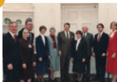
1984 CHA board members and ministry leaders meet with President Ronald Reagan at the White House