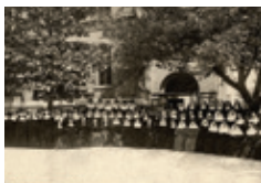
1915 First Catholic Hospital Association Convention in Milwaukee